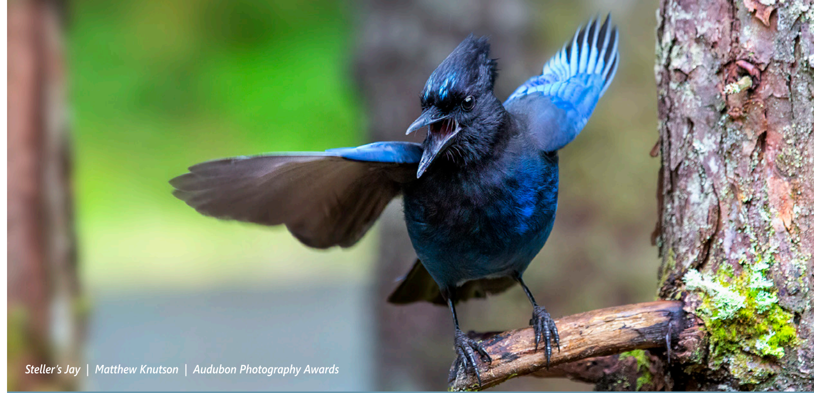
Steller's Jay