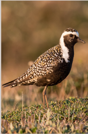
American Golden Plover