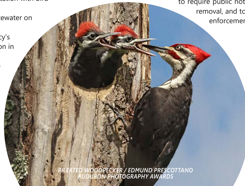
PILEATED WOODPECKER