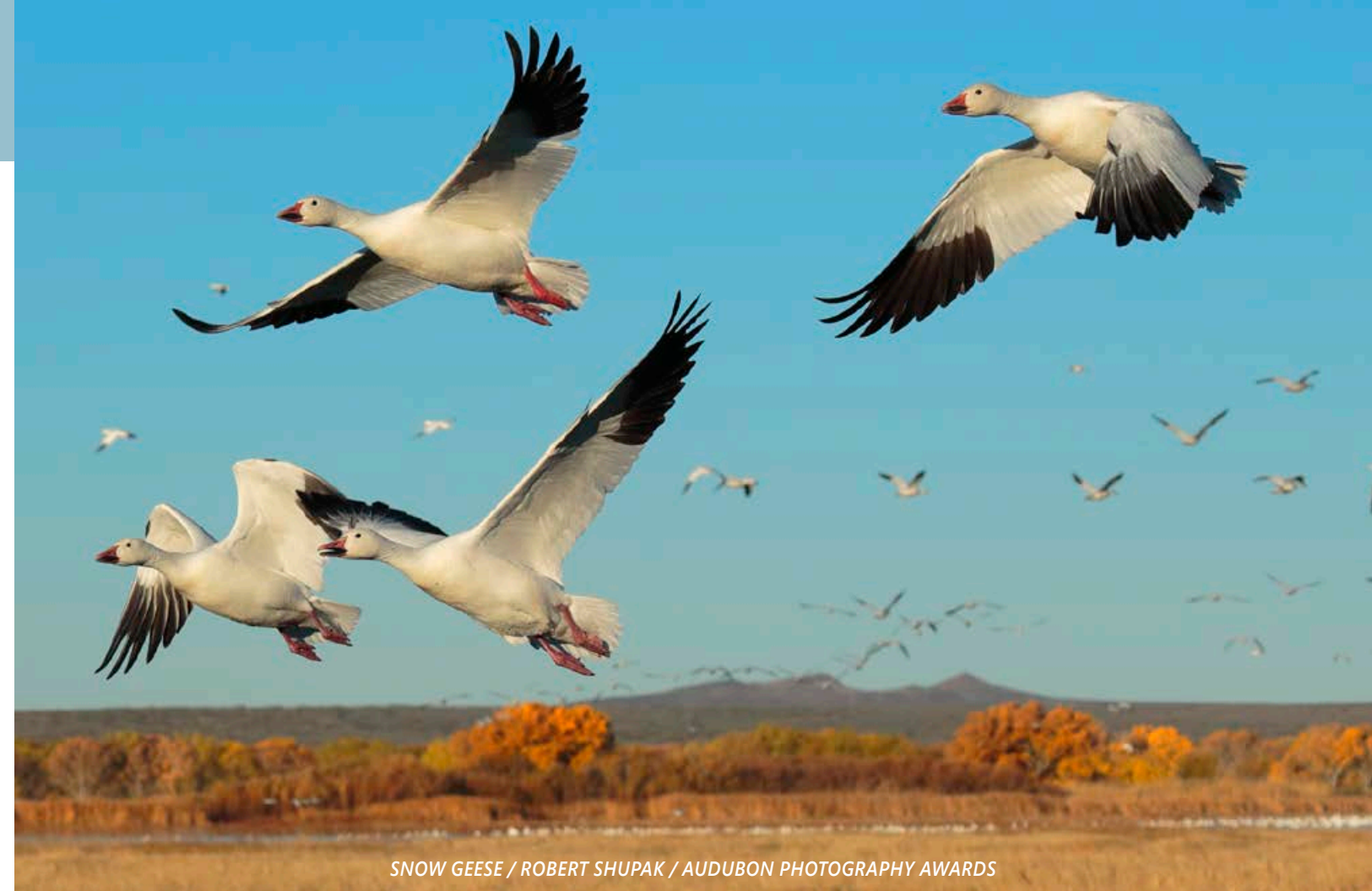
SNOW GEESE / ROBERT SHUPAK / AUDUBON PHOTOGRAPHY AWARDS