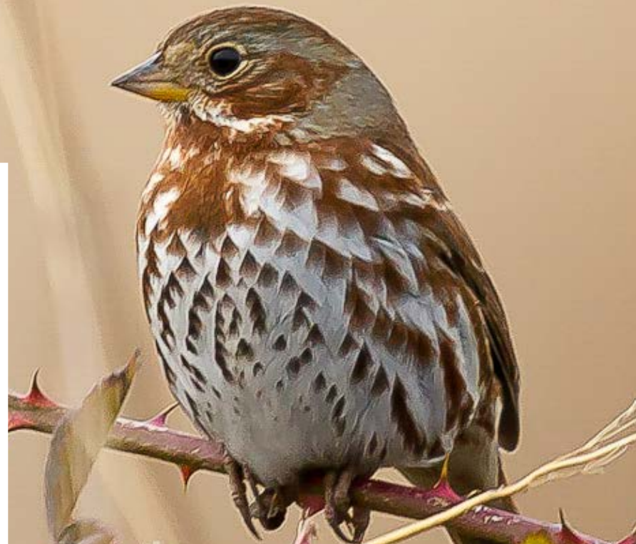
FOX SPARROW

Window-strike-prevention products Bird-friendly, shade-grown coffee